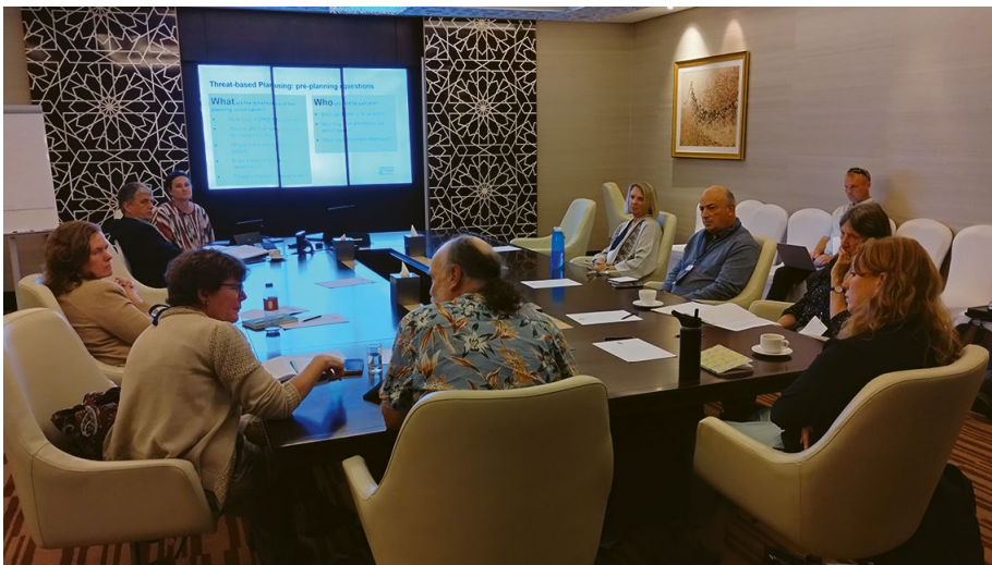
Round table discussion on cross-cutting threats affecting Bird Specialist Groups in Abu Dhabi, October 2024