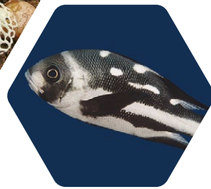
Black and White Snapper ( Macolor niger )