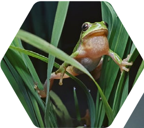
Suweon Treefrog ( Dryophytes suweonensis )