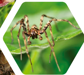
Azores Nursery Spider ( Pisaura acoreesins )