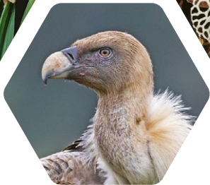
Eurasian Griffon ( Gyps fulvus )