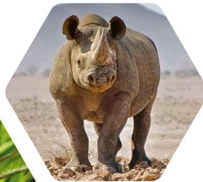
Black Rhino ( Diceros bicornis )