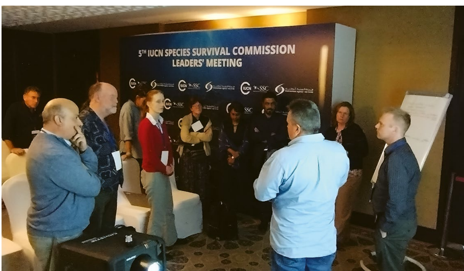
Break out session during SSC Bird Specialist Groups meeting in Abu Dhabi, October 2024