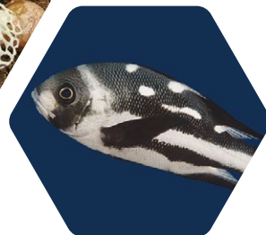
Black and White Snapper ( Macolor niger )