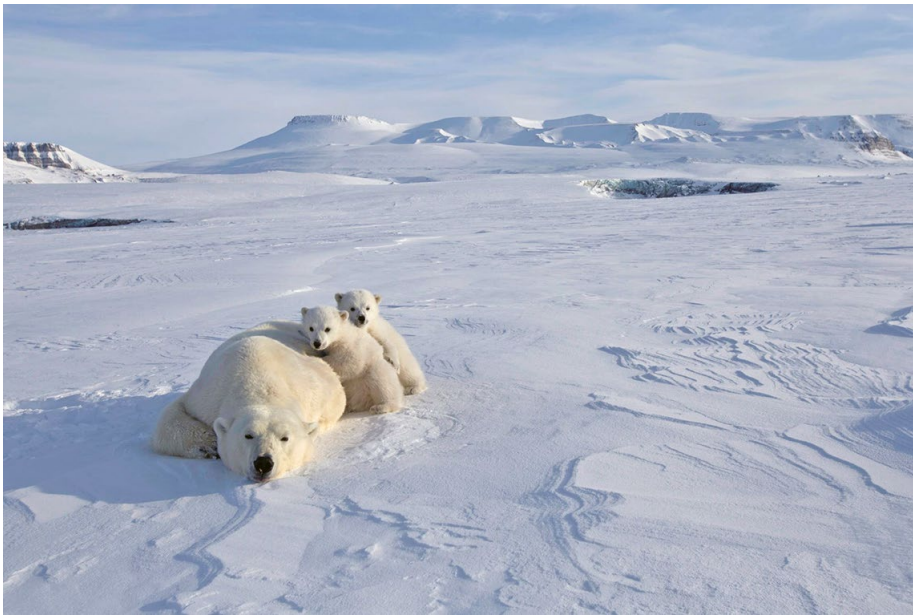
Polar Bear ( Ursus maritimus ) ecology studies - immobilized mother and twin cubs