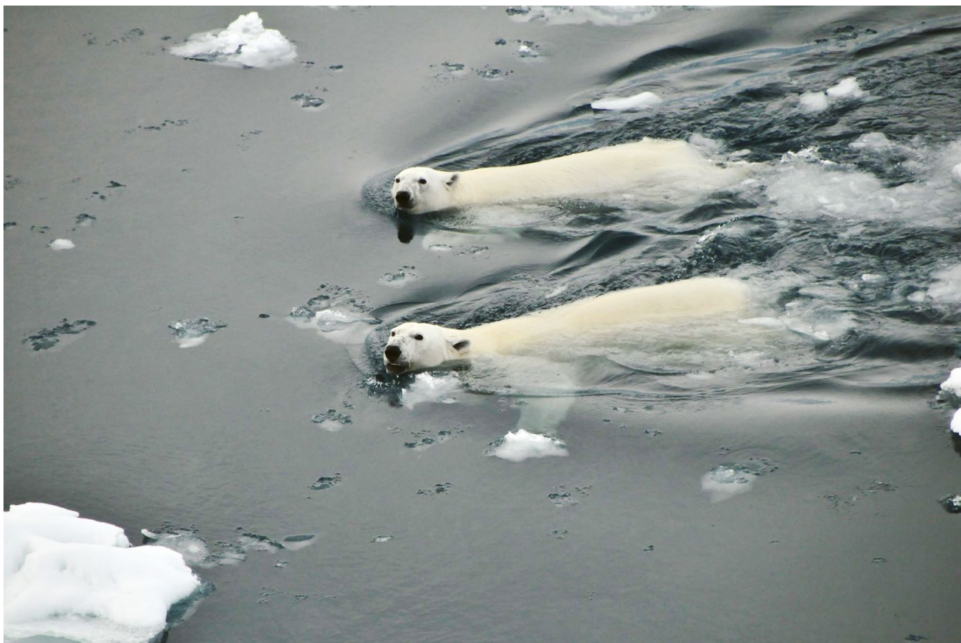
Polar Bears ( Ursus maritimus ) swimming

tools such as capture and satellite telemetry are no longer being used. The PBSG noted that, as the Arctic warms, a variety of scientific methods will be required to collect the information necessary for the long-term conservation of Polar Bears, which is needed to inform management decisions and to support cultural and subsistence use by indigenous communities. In particular, identifying subpopulation boundaries and movement of bears between subpopulations, both on and off land, are critical to subpopulation assessments and mitigating bear-human conflict. This requires Polar Bear location data that can only be obtained by capture and deployment of tracking devices.