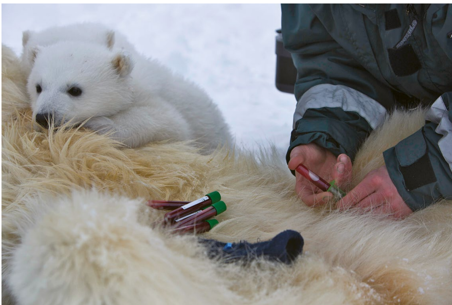
Taking blood sample for health assessment