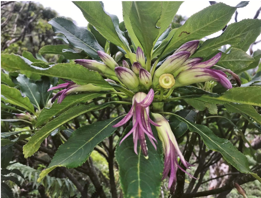
Clermontia hanaulaensis

management activities for 150 plant species. This includes propagule collection from 118 species, threat control for 115 species, and translocations for 41 species totalling 811 individual plants. The Lyon Arboretum and Mid-elevation Rare Plant Nursery Facilities conducted propagation and genetic storage for over 350 plant species, receiving collections from over 200 taxa this year.