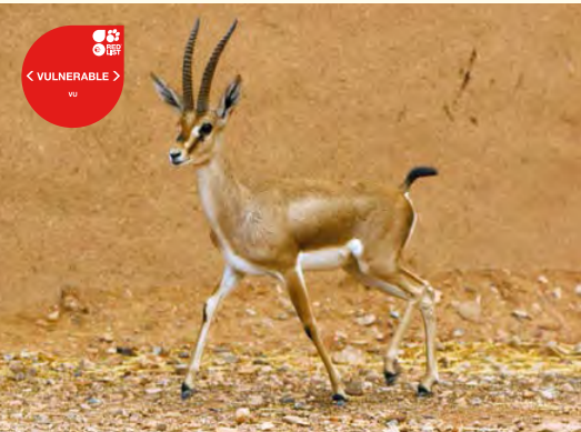
Cuvier's Gazelle – the idmi of North Africa.