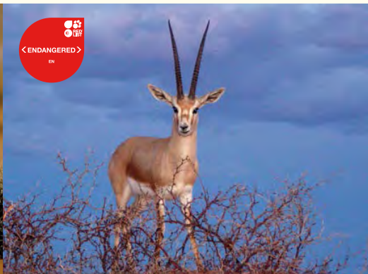
Slender-horned Gazelle – the reem of North Africa.