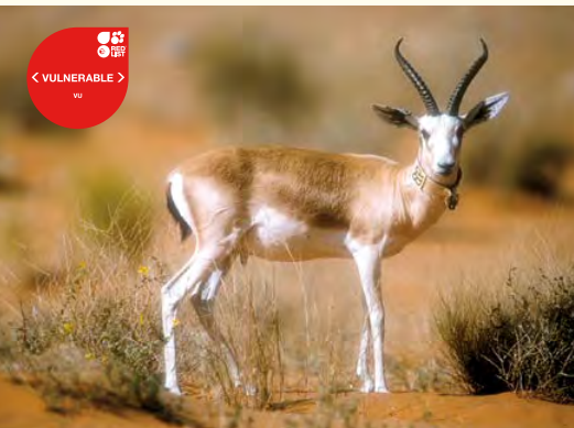
Arabian Sand Gazelle – the reem of the Arabian Peninsula.