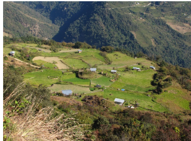
High altitude agricultural field in Bhutan

At the same time the project will assist local authorities and groups in a selected site in strengthening plans for specific EbA activities that address some of their key vulnerabilities. A series of site level trainings and support will be organised leading to the identification of specific EbA activities complementing ongoing measures.