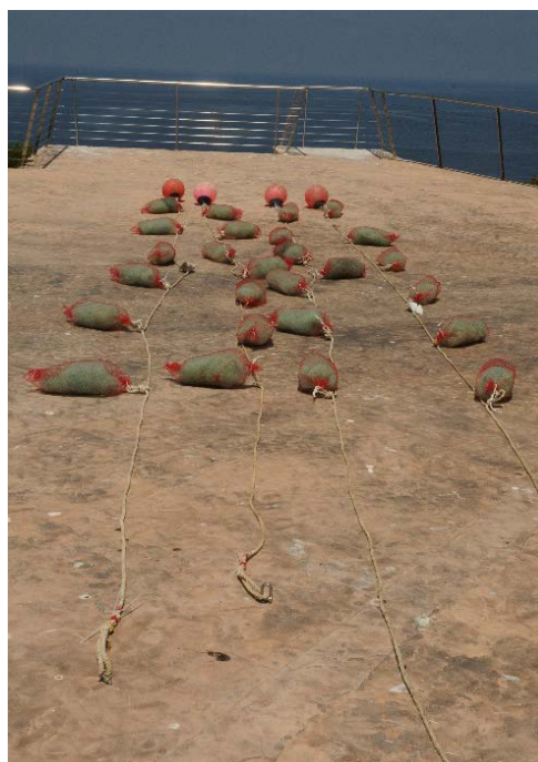
Fig. 2. Collectors' bags attached to the main rope and buoy ready to be deployed.

The bags are attached to a main rope (Fig. 2). The whole system is fixed to a small concrete mooring (or similar, but it must be heavy enough to prevent dislocation by waves and currents) and the rope is kept vertical by a submerged buoy. Submerged buoys (depth > 3m) prevent the whole system to be seen from the surface and potential entanglements with boats.