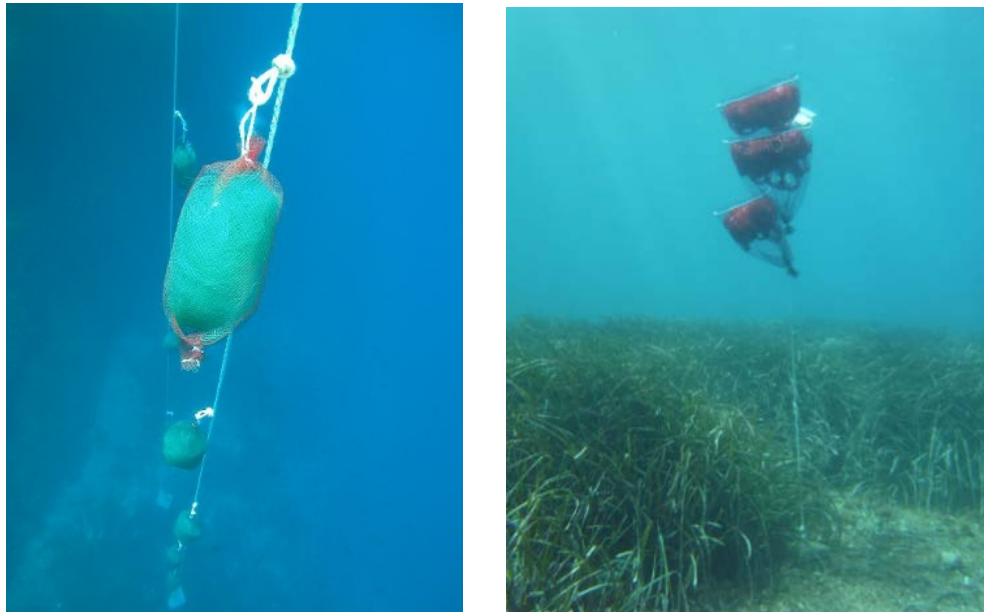
Fig. 3. Larval collector bags attached in 1,5 m intervals in a deep site (left) and a shallow site installation (rightly).

There are several ways to distribute the bags along the rope. In deeper sites the bags can be attached in approx. 1,5 m intervals throughout the rope (Fig. 3), thus covering a wider depth range. In shallow sites the bags can be attached in a single point (Fig. 3). It has been observed that P. nobilis larvae settle in collectors in a wide depth range, so both deeper (for example 15 m) and shallower (for example 5 m) collector installations are possible.