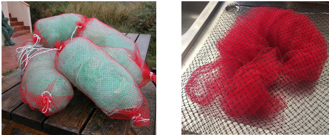
Fig. 1. Two different bag designs. Left. Entangled nylon (trammel net) inside plastic mesh bags. Right. A similar outer plastic bag but using onion nets as substrata inside.