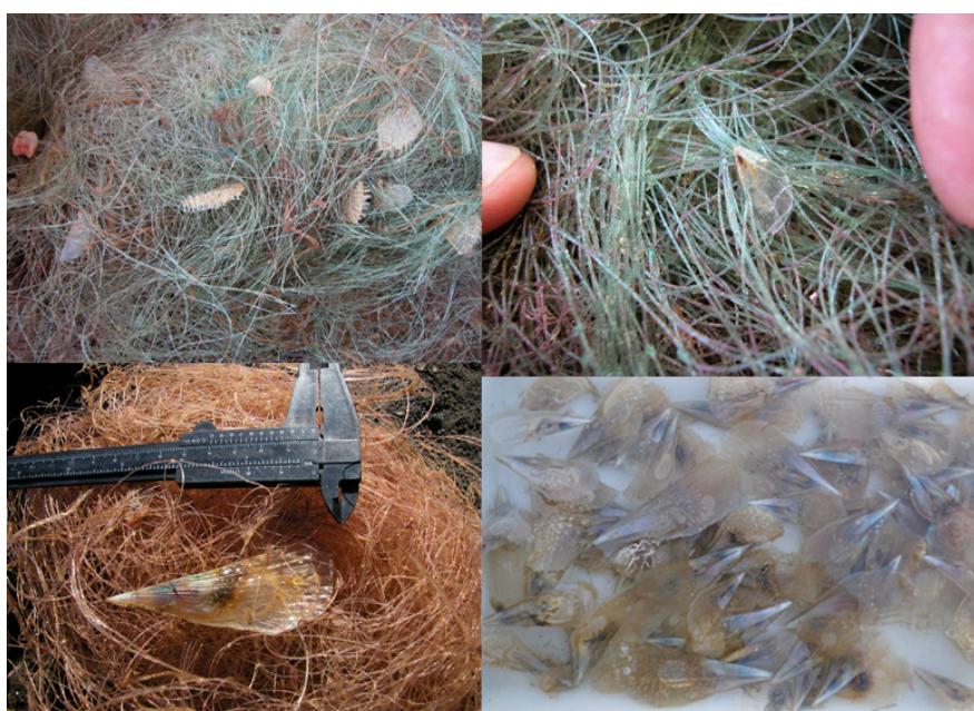
Fig. 4. Pinna nobilis juveniles settled inside the collectors. Notice different morphologies and sizes. Juveniles have to be kept in seawater immediately after extraction from the bags.

At the end of the installation period juveniles' sizes (antero-posterior length) may range approx. from 0,5 – 9 cm. In general, they can be seen by the naked eye inside the tangled fibers (Fig. 4). They have to be removed carefully in order not to break the fragile valves. Juveniles should be immediately placed in seawater after their extraction from the collector bag (Fig. 4).