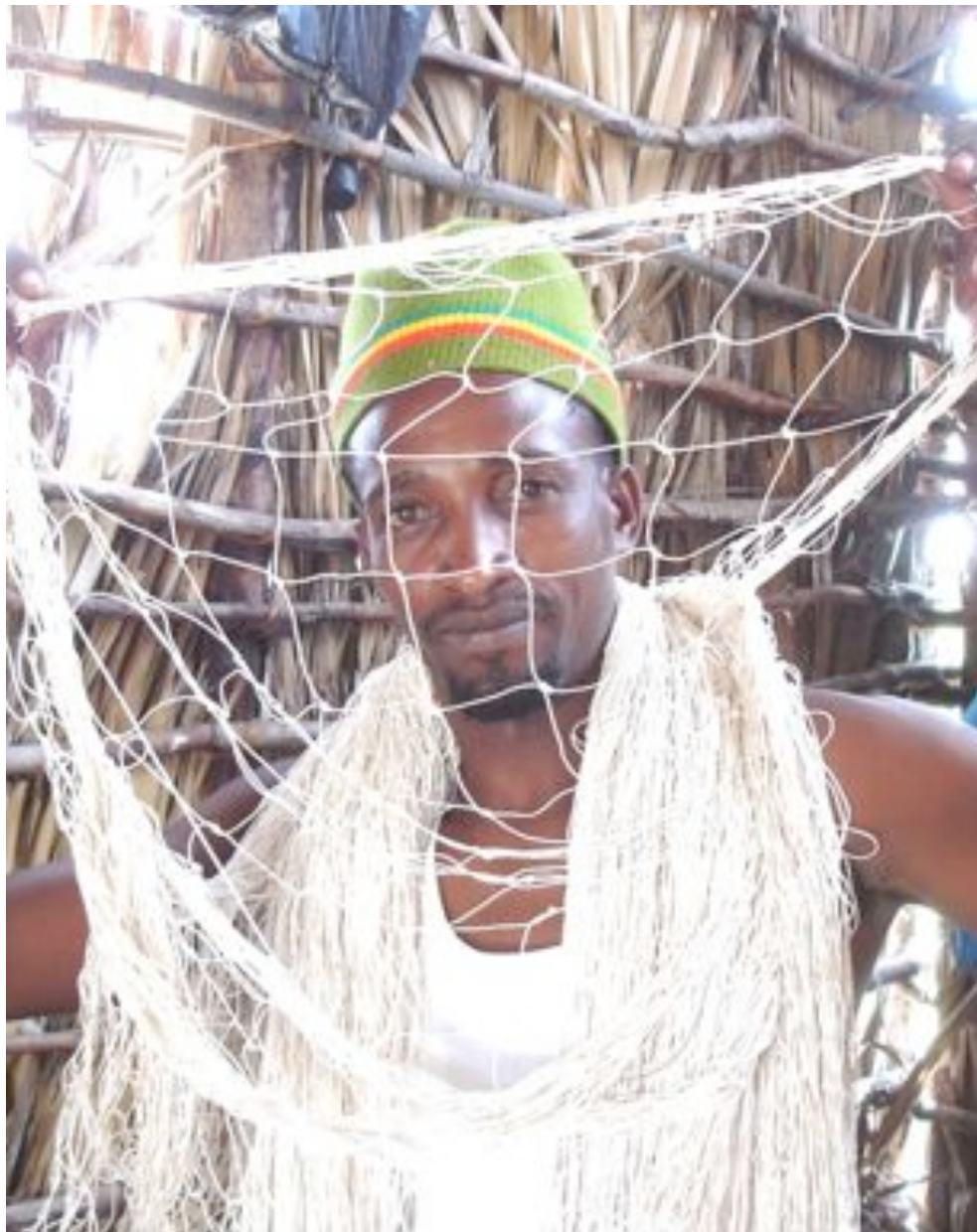
IUCN Eastern and Southern Africa Regional Office 2008

IUCN Eastern and Southern Africa Regional Office PO Box 68200 00200 Nairobi, Kenya Tel:+254-20-890605/12 Fax:+254-20-890615 www.iucn.org/esaro