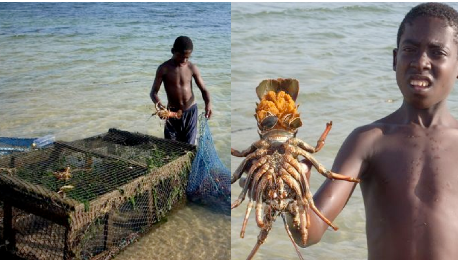
Photo: Lobster cage and berried female at Mkokoni village.