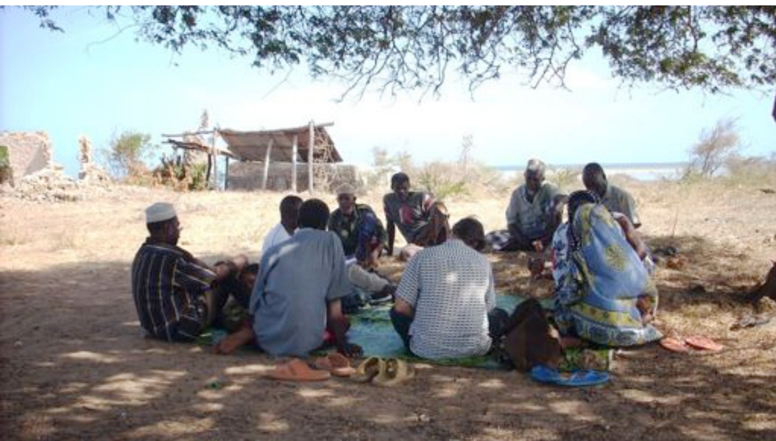
Photo: Focus group discussion.

The Fisheries Department oversees the running of the units by approving management plans as a means of broadening stakeholder participation in fisheries management. The Department is also, though with limited financial and technical capacity, providing training to BMU members. Among the stipulated responsibilities of BMUs are resolving user conflicts, field patrols, ensuring a healthy fishing and landing environment, data collection, enumerating by-laws, ensuring safety in the ocean, control of illegal gears and fishing, protection of breeding sites and maintenance of high fish quality standards.