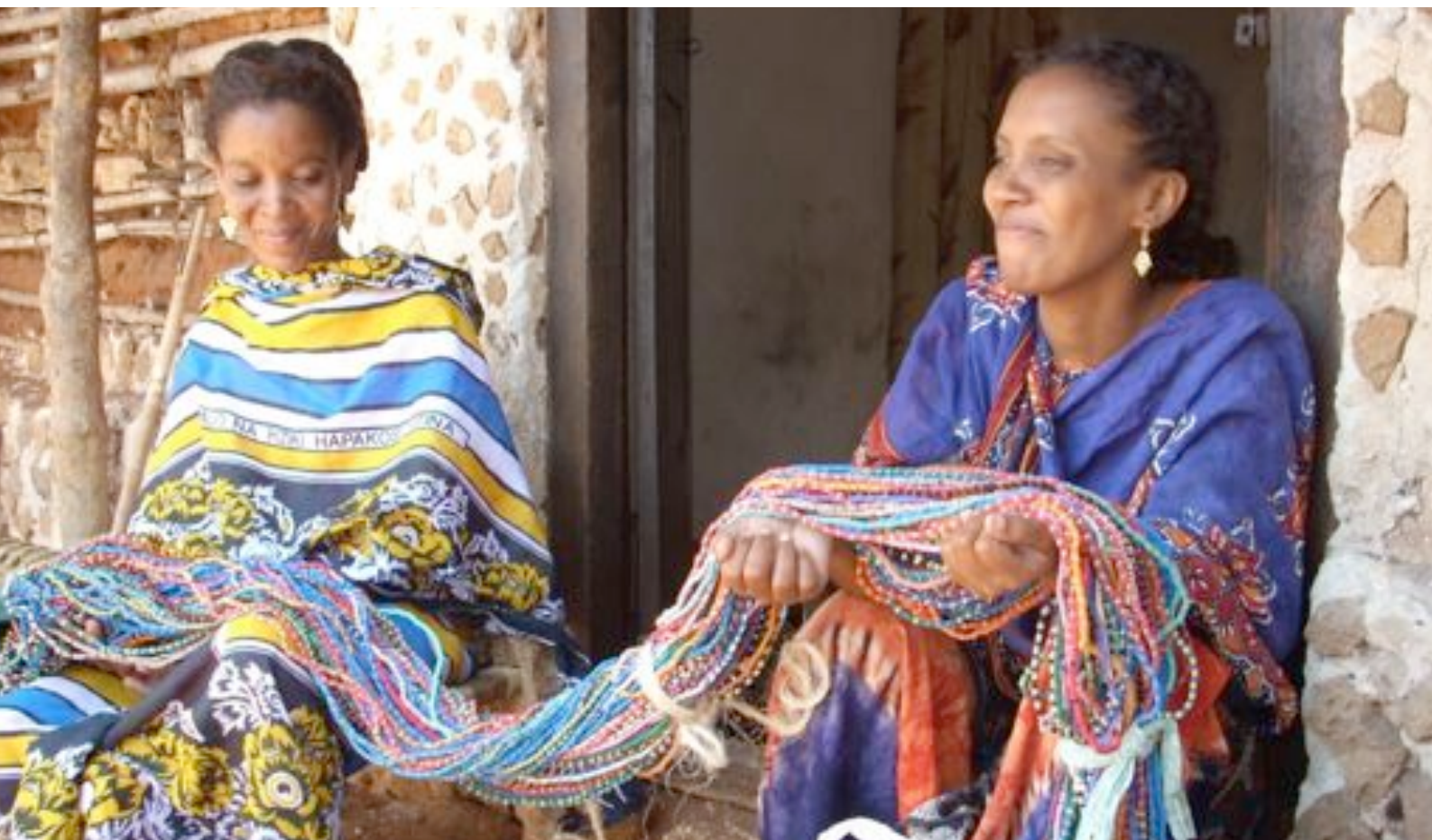
Photo: Flip-flop handicraft in Kiwayu cha ndani.