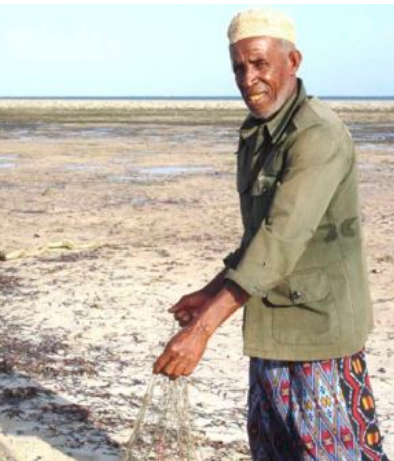
Photo: Jarife fisherman and shark fins at Ishakani village.

In previous years when there was an open international trade in shells and stocks were abundant, collectors made a living out of it. In the last half century, a collector could collect 200 shells in a day worth c. KES 200,