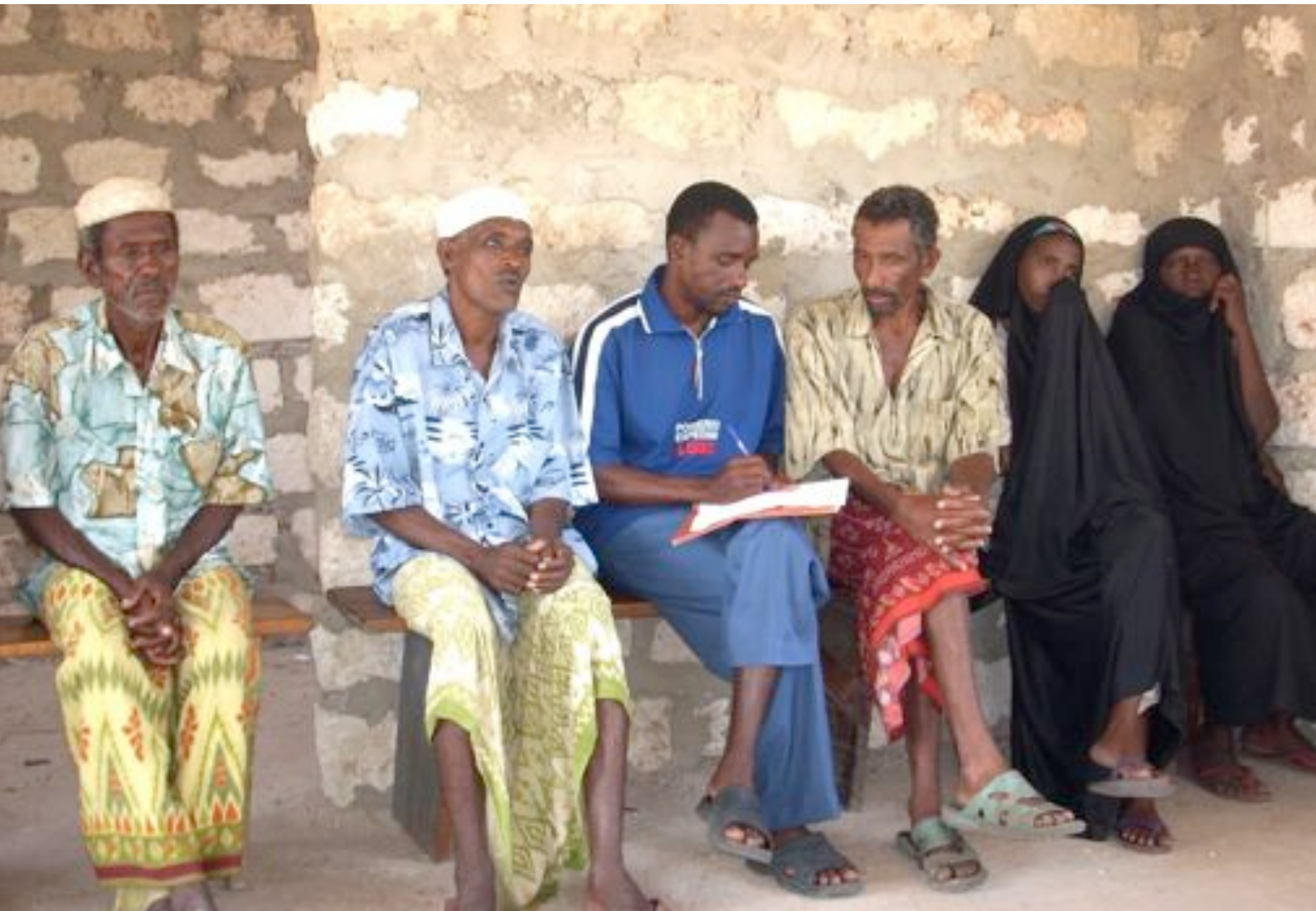
Photo: Kiunga village meeting.

The study employed three methods: i) a literature review of recent publications and reports; ii) meetings with managers and key government officials, including village heads, KWS, Fisheries Department, WWF, and a tourism operator (Appendix 1); and iii) a mix of focus group discussions and individual key informant interviews with 5-6 people in each village in KMNR (Appendix 2) using a semi-structured interview with set questions. These group and individual discussions are hereafter referred to as focus group discussions (FGDs). Focus groups were divided into two: i) village community based organization (CBO) representatives and village chiefs/headmen; and ii) fishers, representing five fishery types of concern, namely lobster, shark, mangrove crab, sea cucumber and cowrie shells.