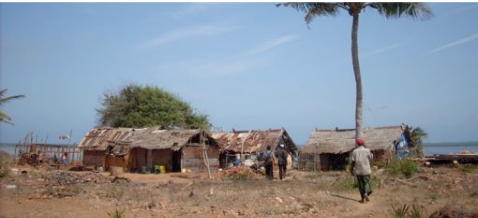
Photo: Ishakani village near the Somali border.