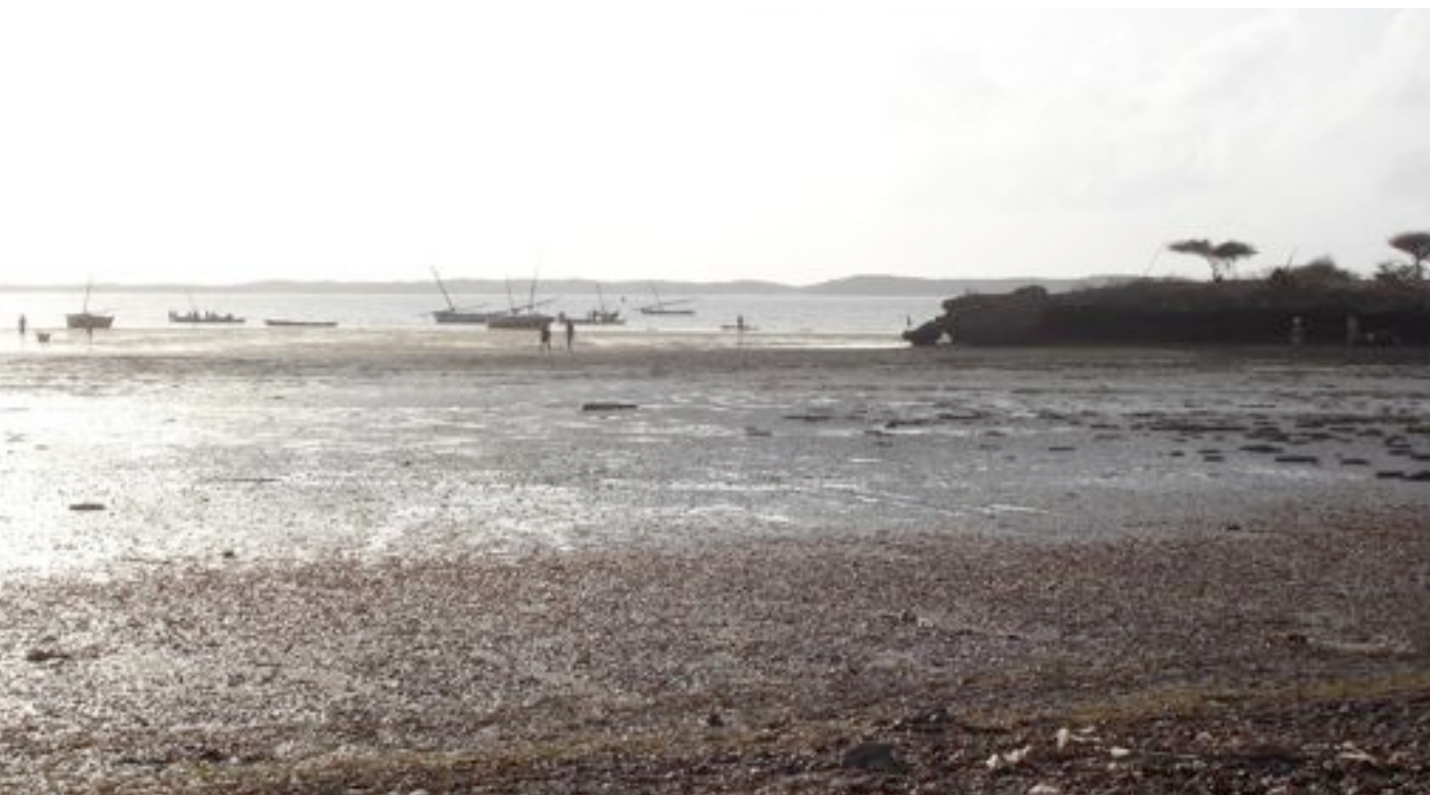
Photo: Beach at Kiunga village.

Lastly, in order to make possible significant gains to the local population while improving environmental sustainability of livelihoods, connectivity between the Kiunga area and outside markets, whether national in the case of much of the marine produce, or international in the case of tourism and handicrafts, must be strengthened. This involves facilitating market access and promoting business linkages, as well as improving communication infrastructure, including telecommunication. The unique natural and cultural characteristics of the area will remain its greatest strength also in a “new” economy, and stand to benefit its people in the long term through higher socioeconomic development and higher environmental sustainability.