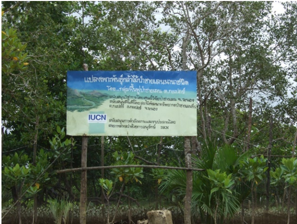
Mangrove nursery.

They now see the main environmental problems facing the area as shrimp farming waste, waste from further upstream in the watershed, and climate change.