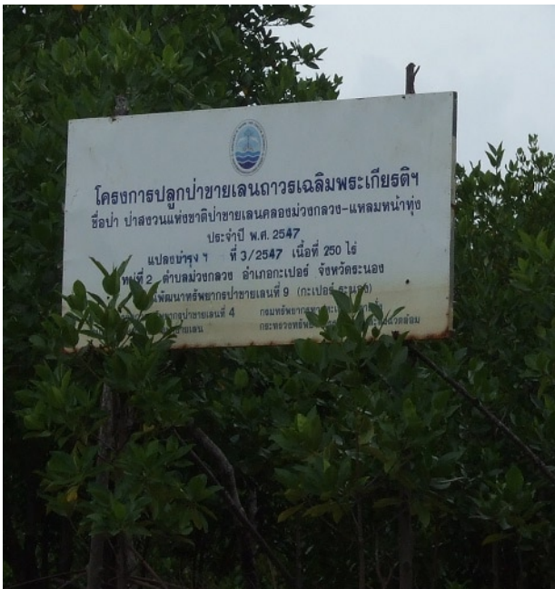
Under the reforestation project in Honour of His Majesty the King, 250 rai of mangrove forest were restored in Muang Kluang sub district.