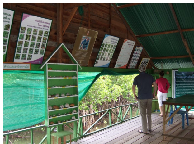
Ban Sam Nak Community Centre.