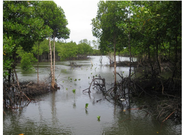
Mangrove rehabilitation.

Ban Sam Nak also has a community education centre, where villagers and school groups can come to learn about the mangroves, shells and fish species in the area. Several years ago Ban Sam Nak worked with the Prince Mahidol University to do an assessment of the biodiversity of the mangroves. Ban Sam Nak now also works DMCR Mangrove Unit #9 on educational activities, and on seagrass and mangrove planting activities.