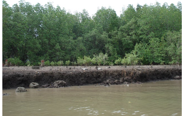
Mangrove rehabilitation.

For the future, the villagers of Ban Kluay Nok would like to get more information about mangrove management, and some money to build a walkway to take local school children and youth groups into the mangroves, teaching about their precious resource.