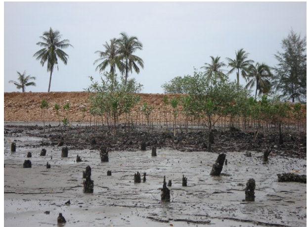
Mangrove rehabilitation.