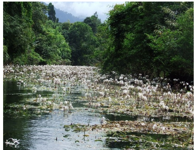
Water lily Na Ca river.

The Na Ca Conservation Group doesn't want to develop community rules that apply to all Pleon Prai Sri Na Ca Group members. They prefer that the government to step in to list the water lily as a protected species.