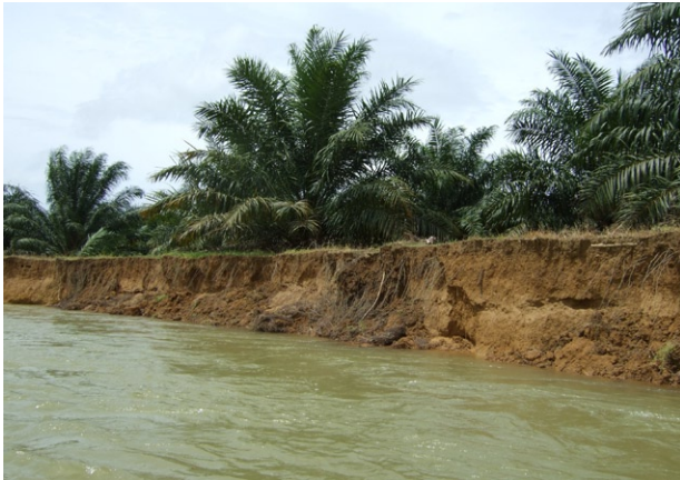
Na Ca River erosion.

in river erosion and exotic species, such as the channeled apple snail ( Pomacea Canaliculata ). At the same time, they saw declining native riparian vegetation, and that the water lily was declining in some areas, but surviving in others. They wanted to research the reason behind this.