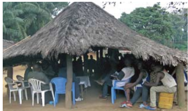
Meeting place in Bokongo village, Bikoro.

IUCN's European-Union-funded project Strengthening Voices For Better Choices (SVBC) works in the Bikoro region of DRC to address these problems. Since 2006 the project has helped break down ancient cultural and community divides by supporting the creation of a regional committee bringing together representatives of local government, village members and their chiefs, and