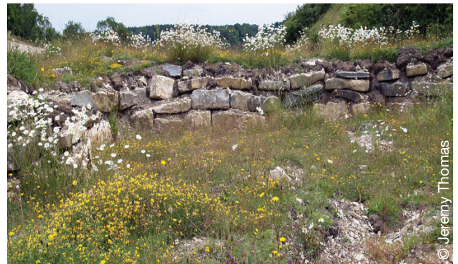
Figure 2: Example of heterogeneity of habitat, CLIMIT project. This new Large Blue site, constructed beside a UK railway line and started from bedrock, contains heterogeneous topography and swards of various heights, which together result in a wide range of soil temperatures which provide warm and cool refuges in years when the weather is, respectively, unusually cold or warm. Overall, the site is cooler than the ideal for the species under current climates, but is expected to provide optimum habitat as the climate warms.

by decreasing or increasing grazing or mowing, or by thinning or increasing the canopy cover in woods can be a way to cope with climatic change. Changing the vegetation patterns of sites results in increased heterogeneity of habitats which has proven to be an effective tool to improve species adaptability.