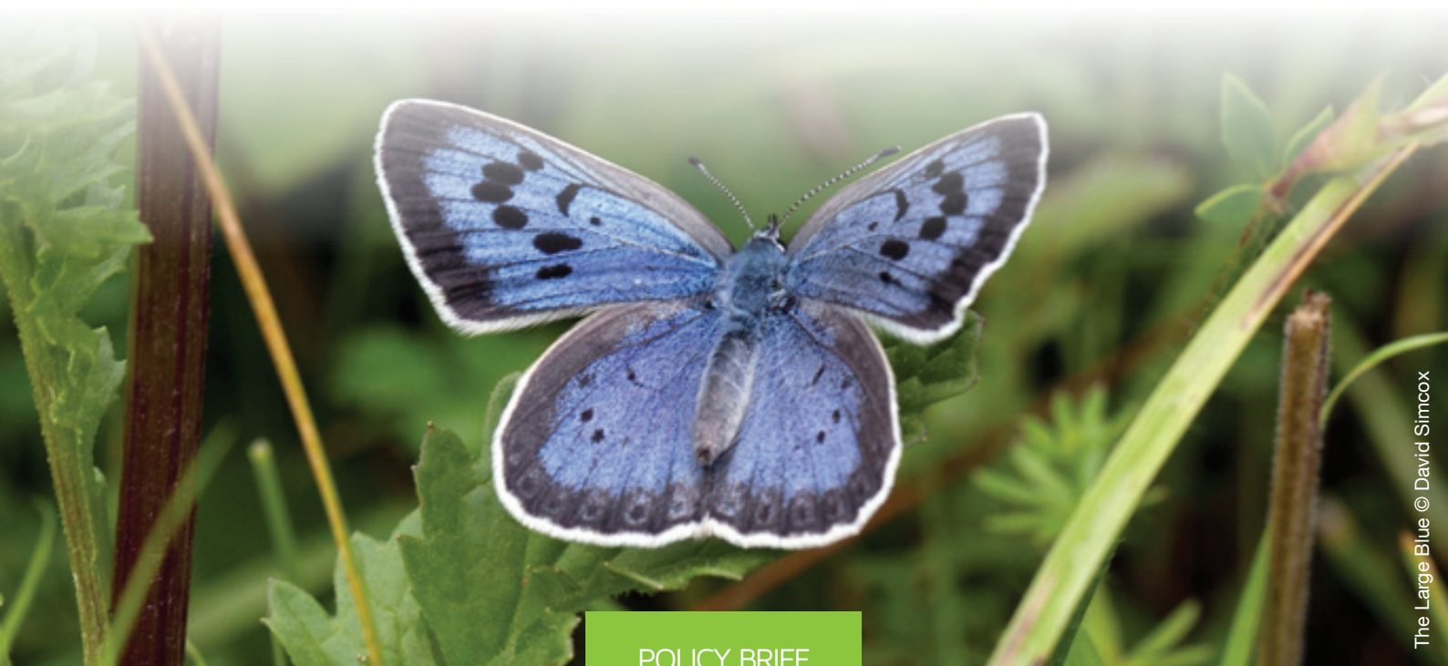
The Large Blue © David Simcox