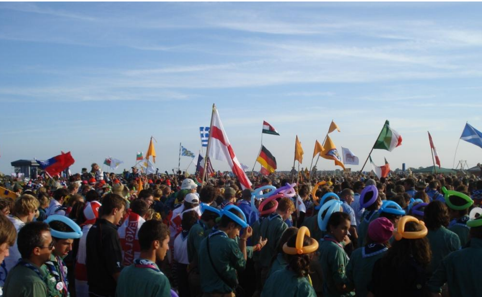
World Scout Jamboree