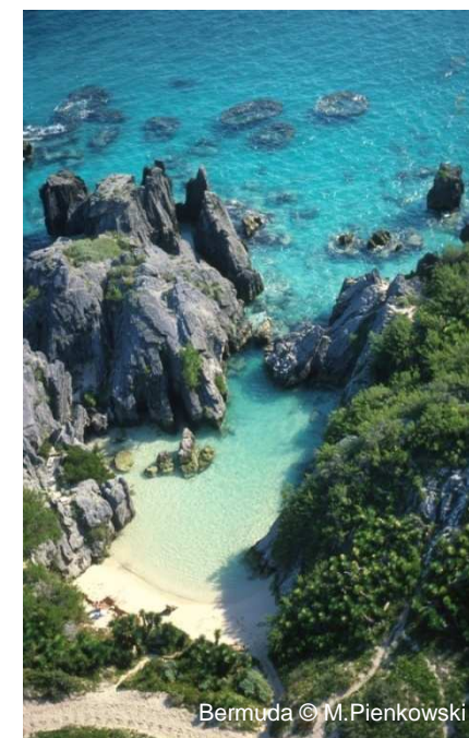
Bermuda © M. Pienkowski