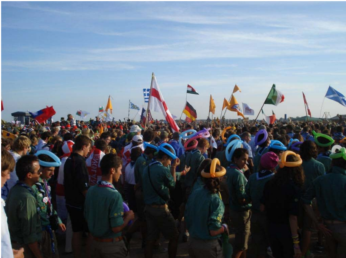
40,000 Scouts attended an international cultural day event at the 22 nd World Scout Jamboree