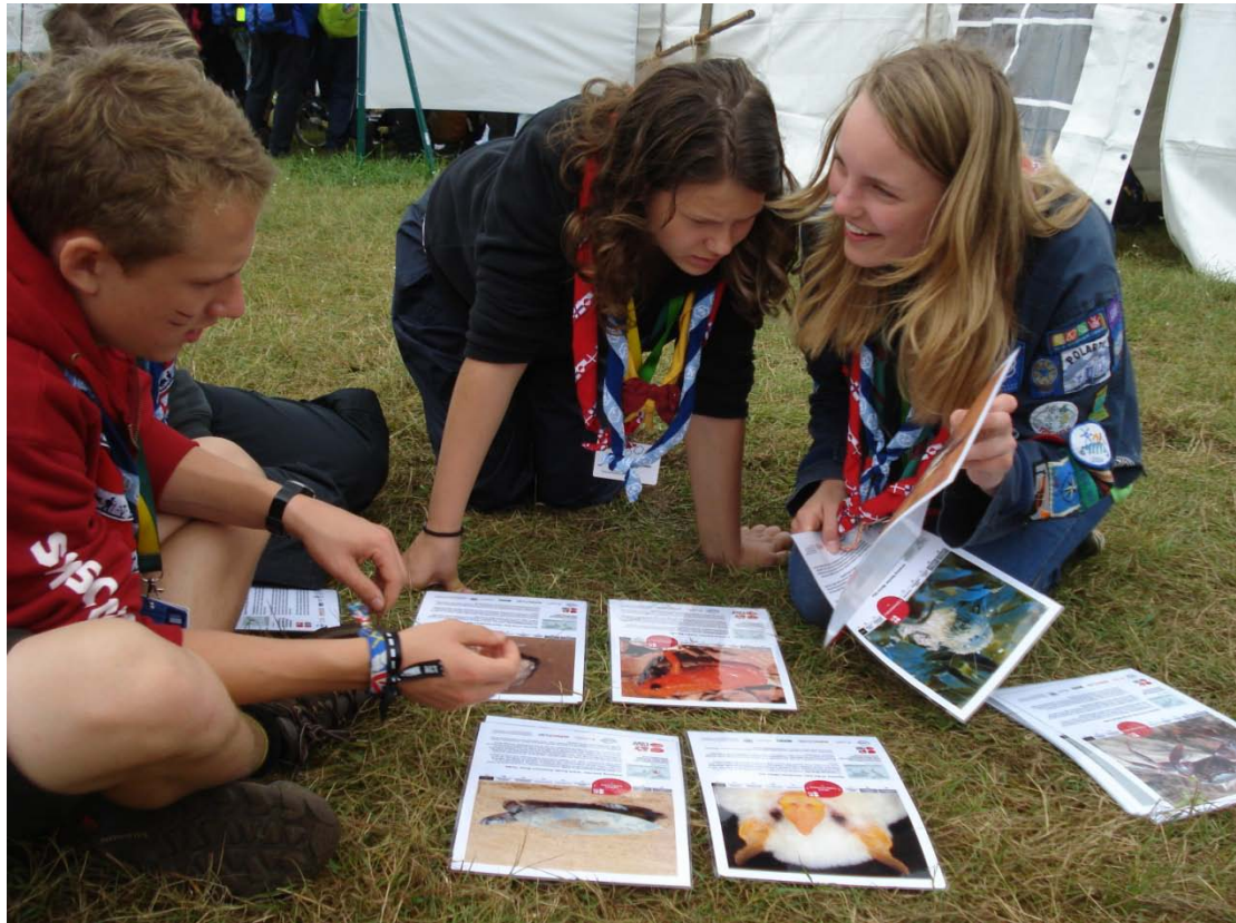
Scouts discover some of the threatened species in the biodiversity workshop