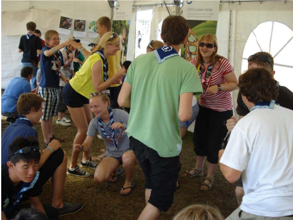
Scouts play the 'Evolution' game as an energizer in the environmental rights of the child workshop