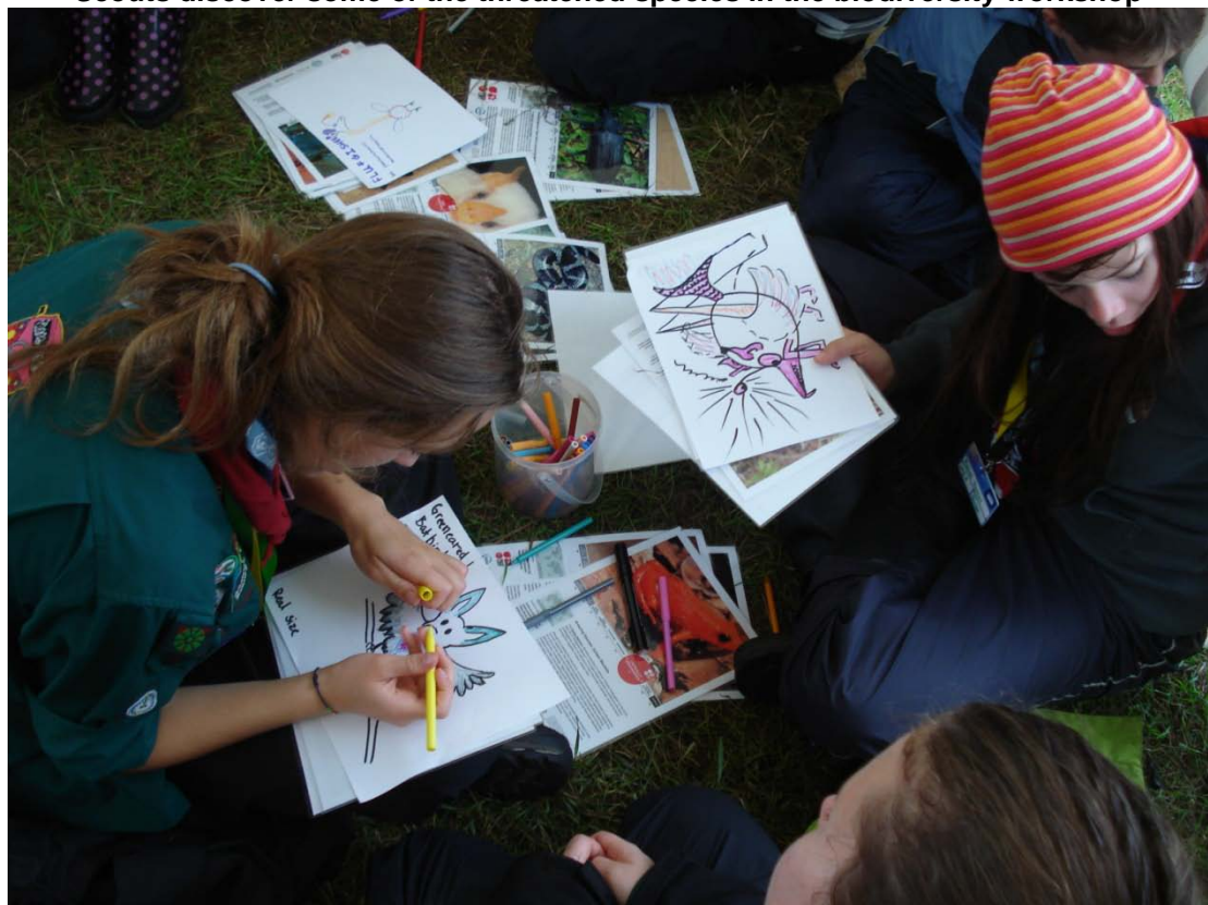
Scouts create a new species in the biodiversity workshop