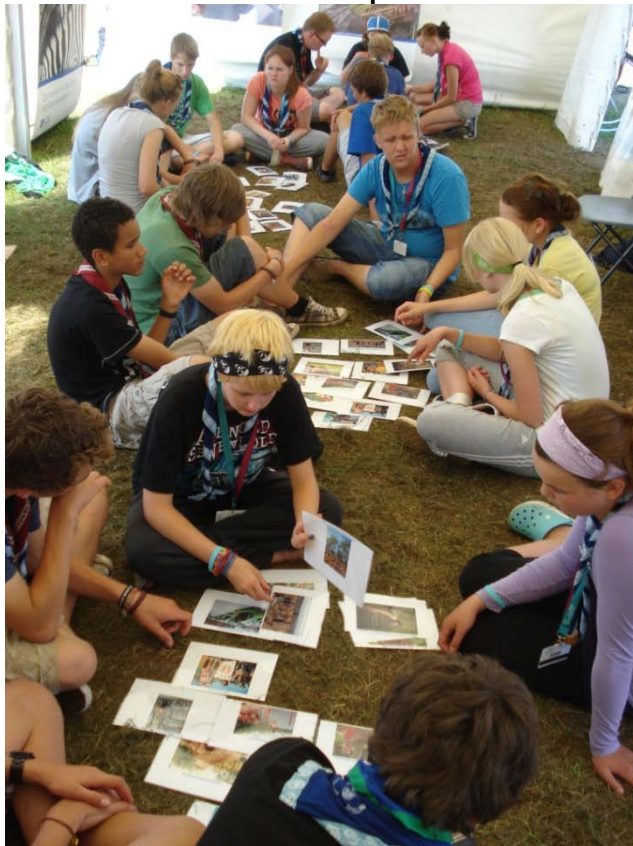
Scouts debate the highest priority environmental rights of the child