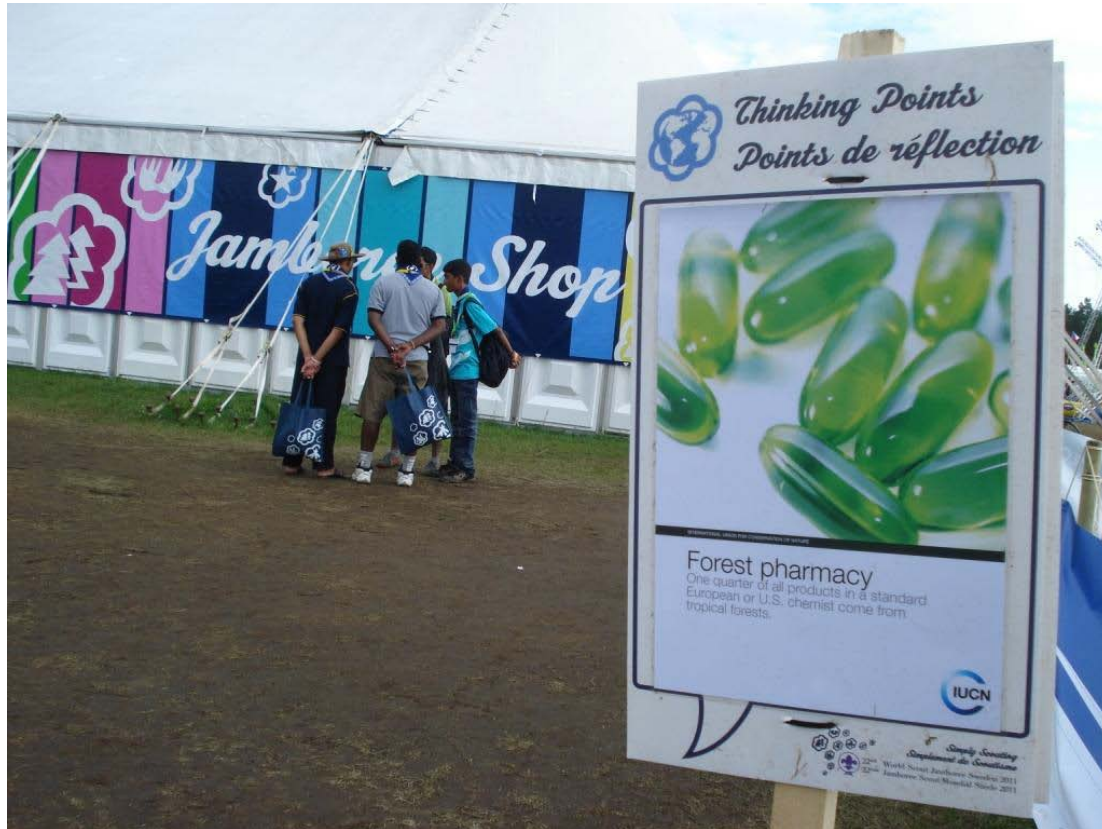
One of the IUCN 'Thinking Point' posters on display around the Jamboree site