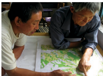
Forest management planning, China

Viet Nam is a major exporter of wood furniture to Europe and North America. While the industry is fast-growing, there is currently limited domestic timber production and the furniture industry depends heavily on timber imports, much of it from high-risk countries such as Lao PDR and Cambodia. Ensuring the legality and sustainability of its timber supply is a major issue for Viet Nam if it is to continue to sell wooden products to discerning markets. To help Viet Nam meet this challenge, the LLS initiative provides information and convenes diverse stakeholders to identify and discuss Forest Law Enforcement, Governance and Trade (FLEGT) measures to expand the national and international supply of legal timber. LLS also conducts research on pro-poor sustainable forest management, and has established networks linking experts, researchers, government officials, and forest dependent communities to share and generate practical information for policy action.