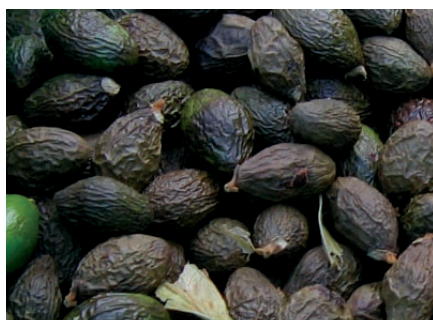
Marketing Non Timber Forest products, Lao PDR