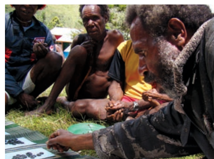
Mapping local use, Indonesia