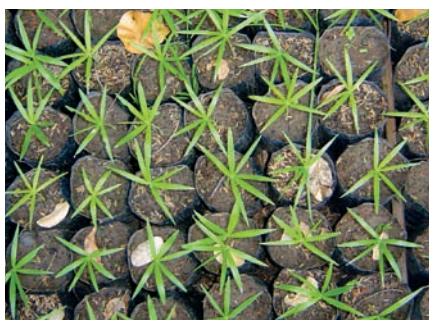
Rattan seedlings, Lao PDR