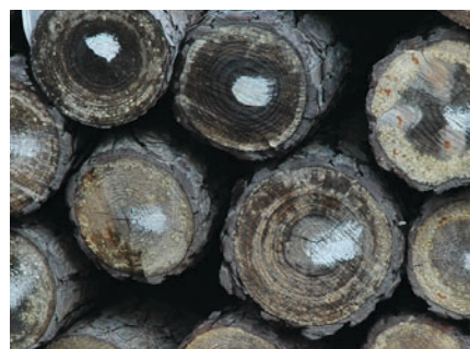
Helping to ensure legal timber trade, Viet Nam