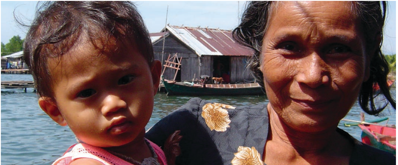
Improving local access and strengthening governance, Cambodia

Realizing local visions for the best possible use of resources across landscapes