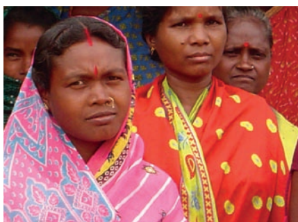
Strengthening Joint Forest Management, India