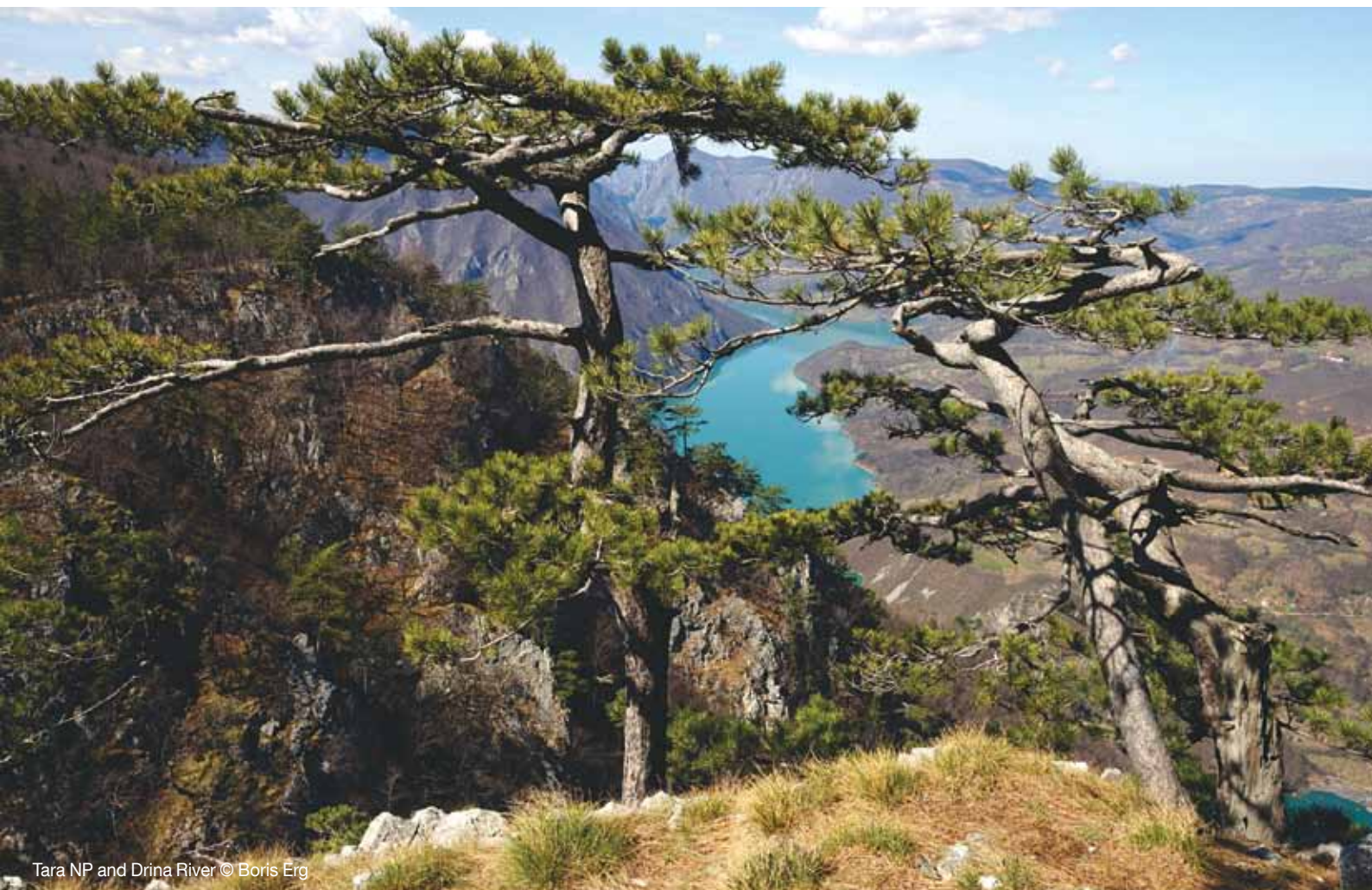
Tara NP and Drina River

According to the last UNWTO figures, in 2011 there were 982 million international tourist arrivals worldwide and international tourism receipts exceeded US$ 1 trillion for the first time. 7 In the last decade, tourism in many PAs has grown, and it is expected that this will continue in the future. Traditional mass tourism such as “sun-and-sand” resorts has reached a steady growth stage. In contrast, ecotourism, nature, heritage, cultural and soft adventure tourism, and subsectors such as rural and community tourism are predicted to grow more rapidly over the next two decades.