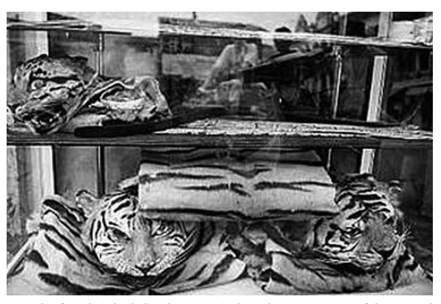
Tiger skin for sale in herbalist shop in Yanji China that was not part of the Interpol enforcement action It may have come from Changbaishan a Biosphere Reserve in northeast China at the North Korean border.

In Thailand, the Royal Thai Police arrested a number of alleged tiger smugglers connected to cross-border trade, including