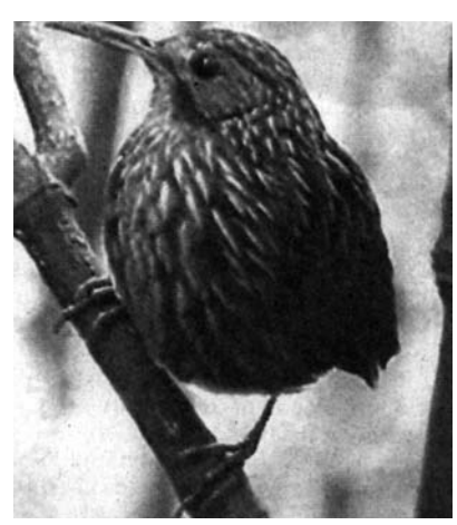
Long-billed Wren Babbler