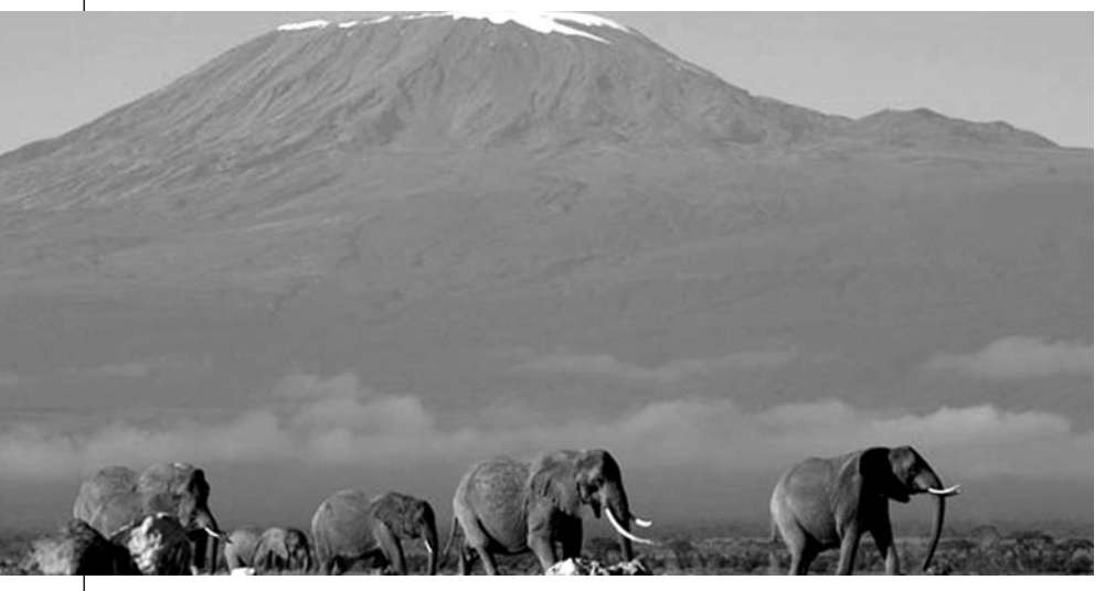
A herd of elephants walk in the Amboseli game park in Kenya. The species is now being targeted by insurgents.

Nairobi, Oct. 14: The seizure of elephant ivory in the Al Shabaab controlled area of Somalia has raised concerns the rebel group may be targeting Kenya's wildlife trophies to raise funds for its war activities.