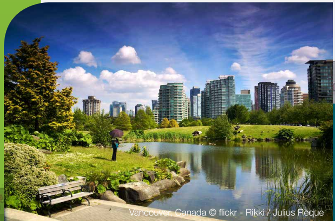
Vancouver, Canada

The World Environmental Hubs initiative gives recognition to cities and regions showing leadership for sustainable development, and establishes a global platform for exchange of knowledge and best practices to facilitate the transition towards sustainable and resilient societies.