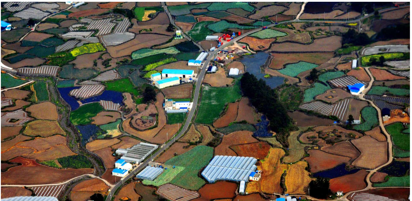
Landscape in Jeju, Korea

You will be part of a global movement seeking to promote a just and equitable world in which nature is recognized as an essential provider of vital ecosystem services and a key contributor to economic prosperity and social well-being.