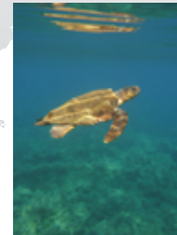
▲ Loggerhead Turtle at the National Marine Park of Zakynthos