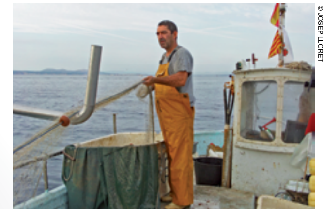
Artisan fisherman at Cap de Creus, Spain