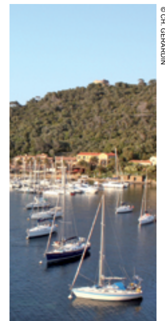
Harbour and village of Port-Cros, France